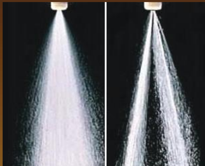
GOOD SPRAY PATTERN

Carbon Crusher contains state-of-the-art detergents to help remove stubborn carbon deposits throughout the entire fuel system, including both traditional coke deposits and internal diesel injector deposits (IDID). IDIDs are found in high pressure common rail fuel systems. Carbon Crusher keeps the fuel system clean, which improves combustion and reduces diesel particulate filter (DPF) regeneration cycles.